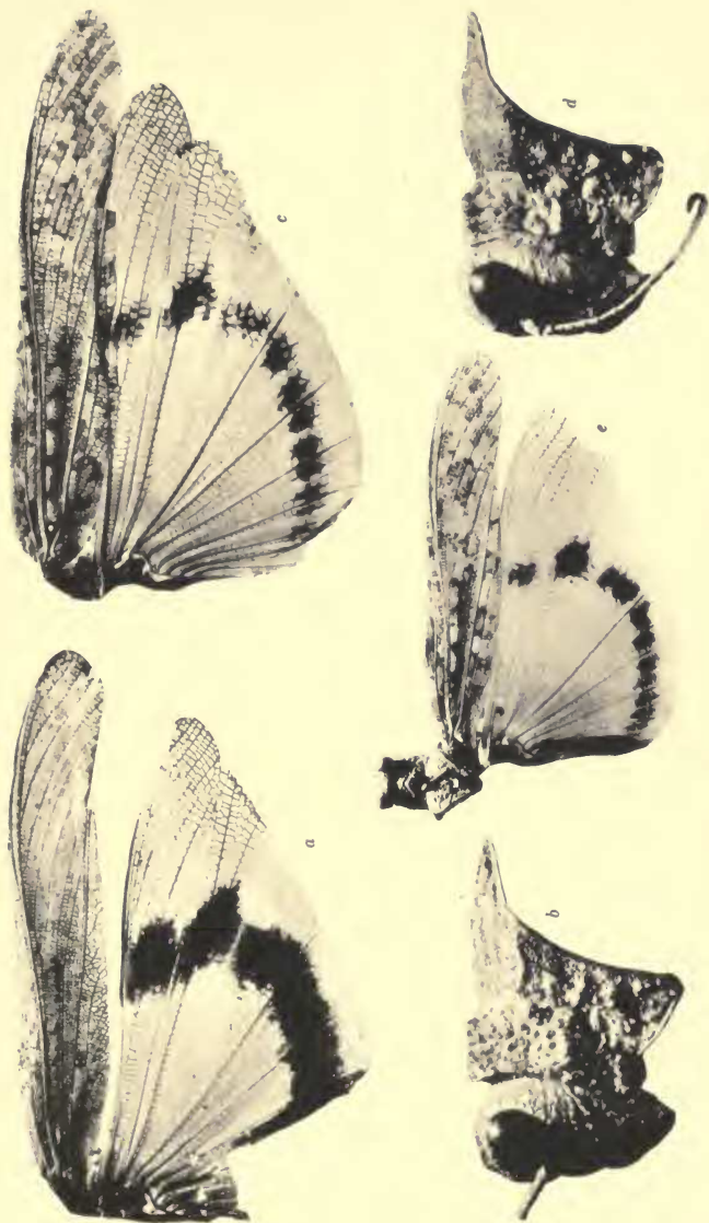
FIG. 60. a, b. Elytron, wing, head, and pronotum of female Ulysses syriacus syriacus (L. Bolivar). c, d. Elytron, wing, head, and pronotum of female Ulysses syriacus zahrae Uvarov. e. Elytron, head, pronotum, and wing of male U. s. zahrae Uvarov.